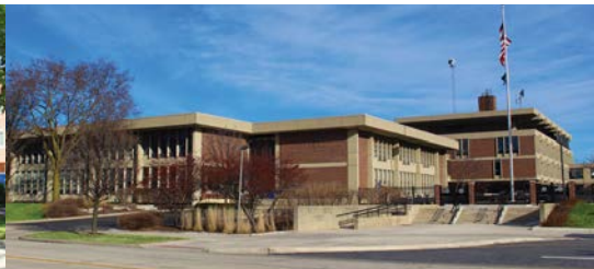
New Trier Northfield Campus 7 Happ Road, Northfield, IL 60093