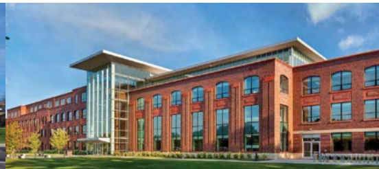
New Trier Winnetka Campus 385 Winnetka Avenue, Winnetka, IL 60093